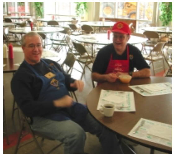
Who do we have here?