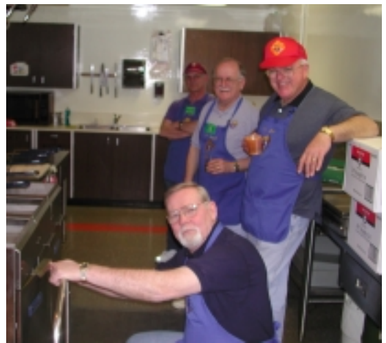
the Fryers are working great and so are the fryers(those that fry)!