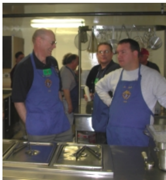
what are we waiting for...?

Here are some pics from this year's first 3 fish frys.