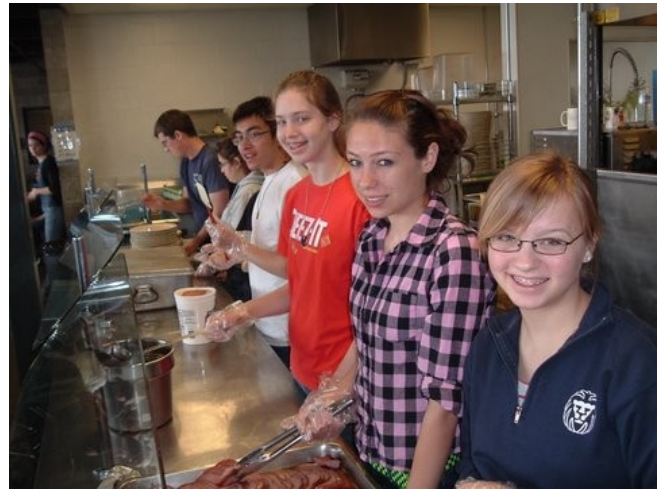
Service with a smile