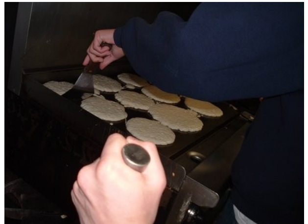
Cakes on the griddle