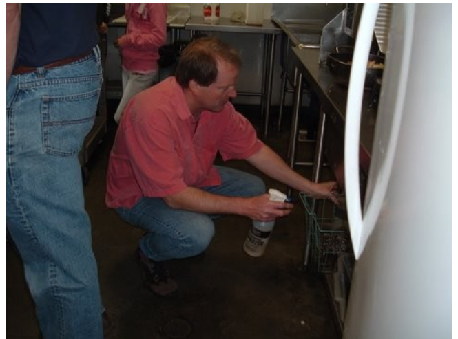
So many choices. Which of these cleaning solutions should I use?