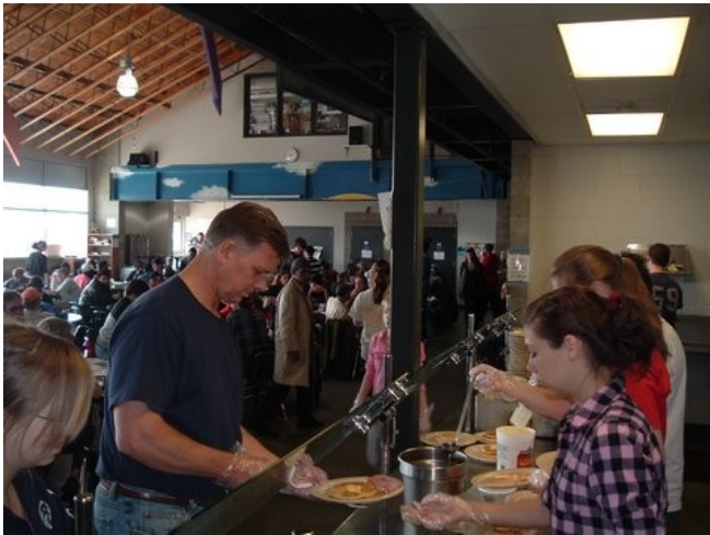
Volunteers line up to deliver food