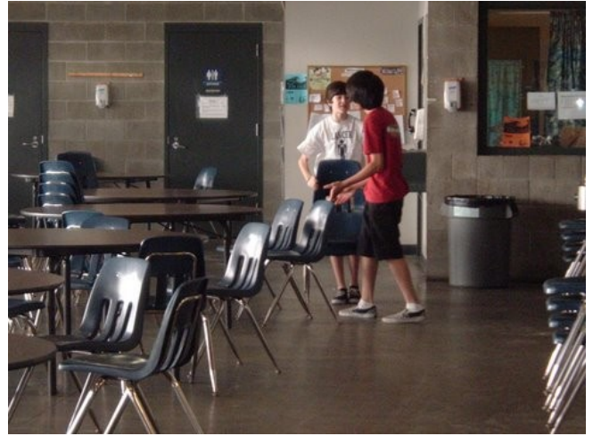
Setting up chairs