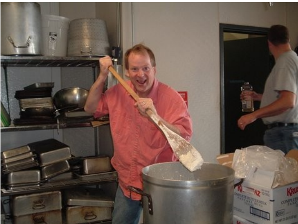
Are we having fun yet?